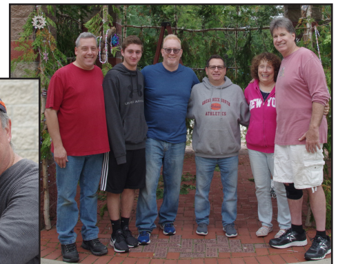
Building the Sukkah