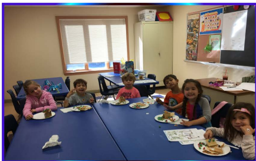
Kindergarten/1st grade Edible Sukkah Creations